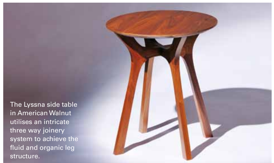
The Lyssna side table in American Walnut utilises an intricate three way joinery system to achieve the fluid and organic leg structure.