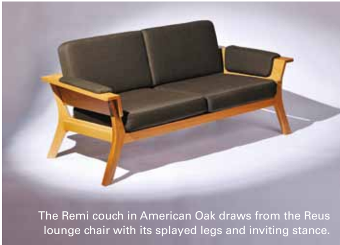
The Remi couch in American Oak draws from the Reus lounge chair with its splayed legs and inviting stance.